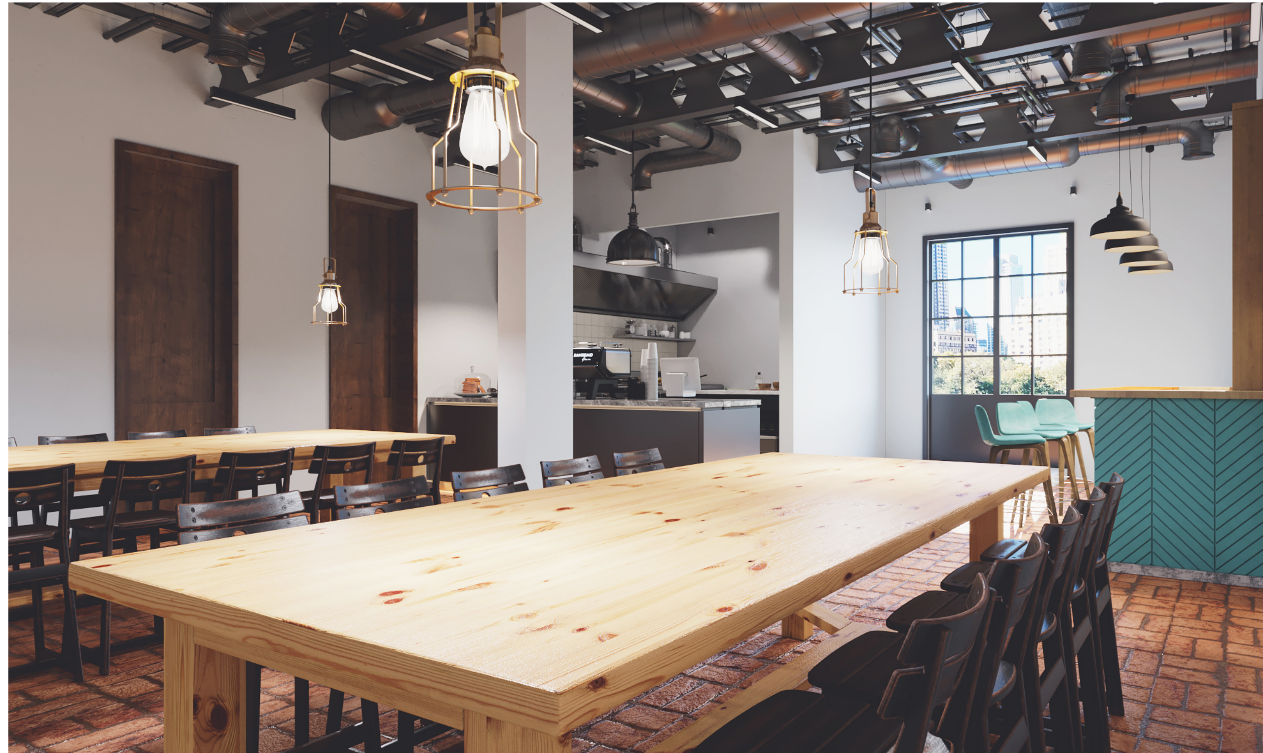
HOSPITALITY VENUE (3D MODELING)