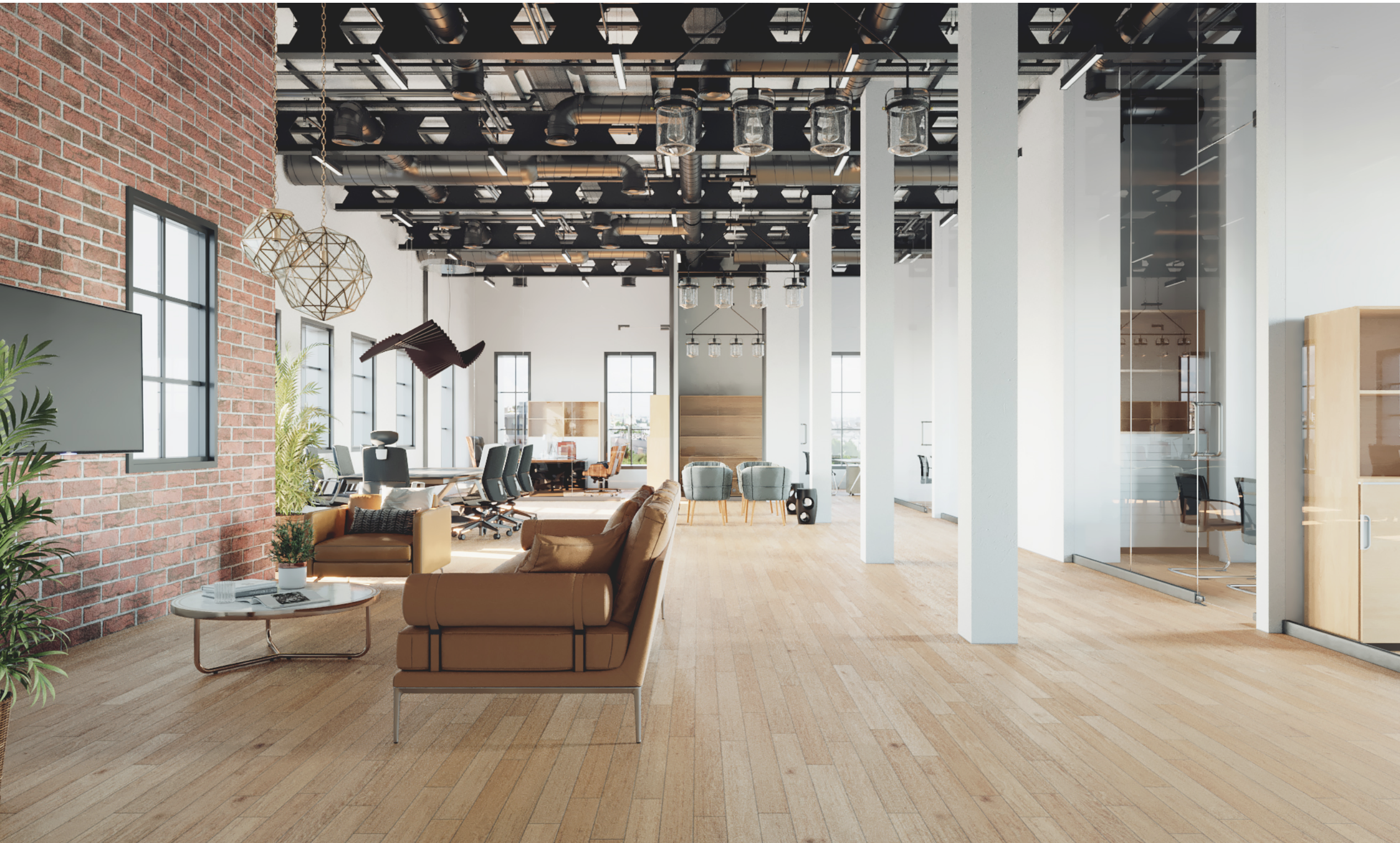
UPPER LEVEL PLAN (3D MODELING)