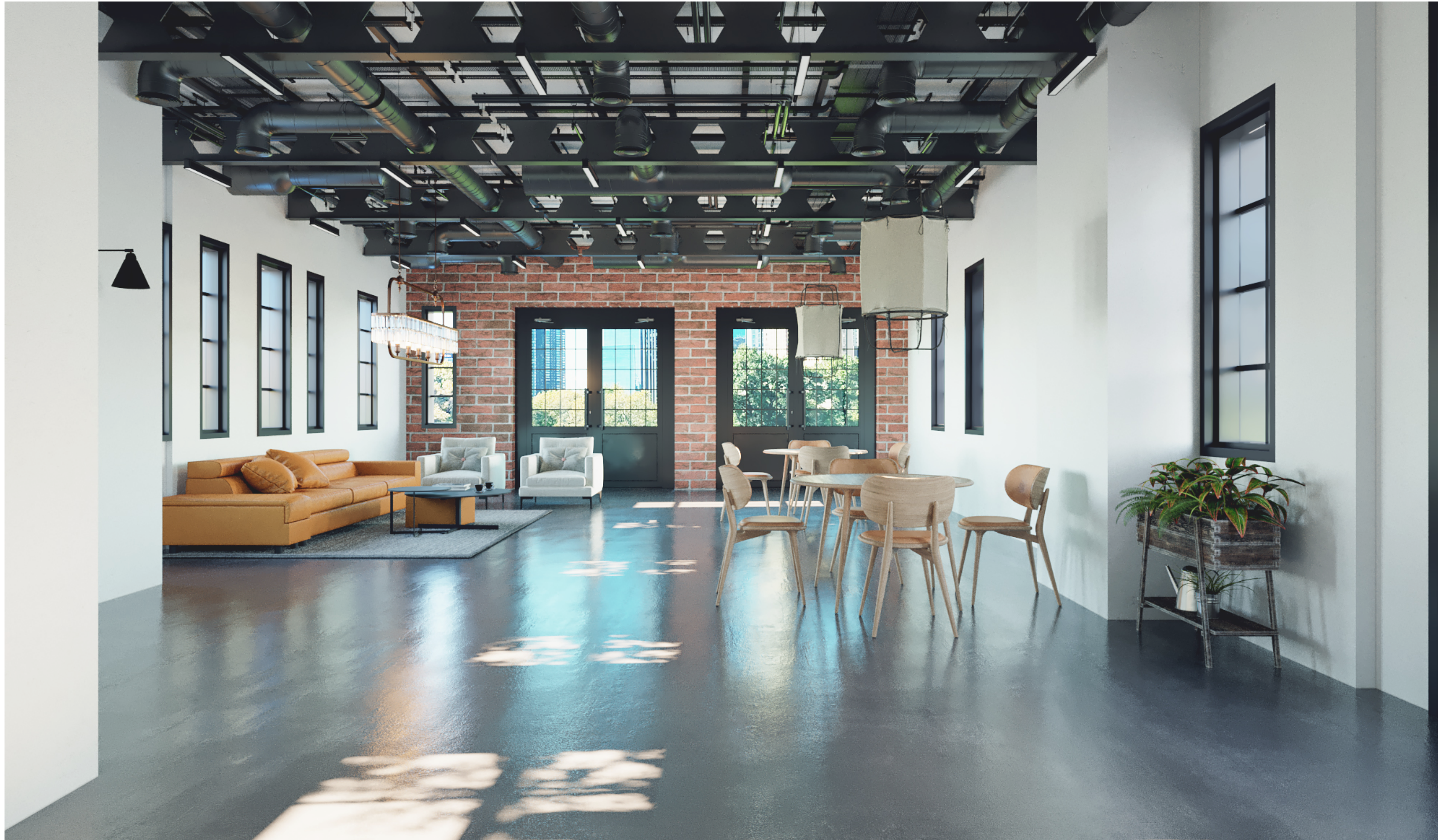
MULTI-PURPOSE AREA (3D MODELING)